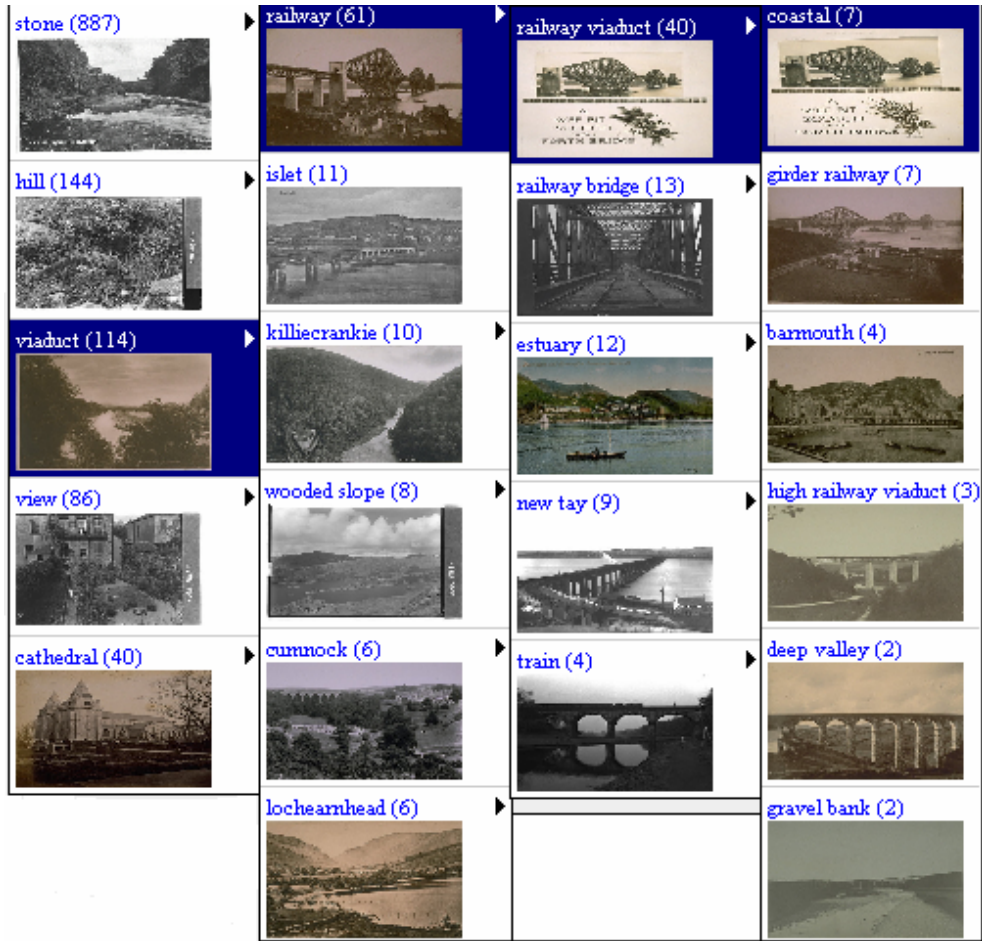
Figure 4: Example fragment from generated menu for the query “stone viaducts”

So far we have only carried out preliminary evaluation of the concept hierarchies for image retrieval and there are many interesting avenues we would like to explore. For example, we plan to carry out a user study in a manner similar to Joho et al. [4] where the hierarchies are evaluated in a practical retrieval setting. We also plan to contrast the success of hierarchies for retrieval based on displaying text-only, image-only and then text and image. We would like to investigate further their usefulness individually and collectively for generating a visual concept hierarchy. Another planned experiment will use the ImageCLEF test collection to compare where relevant images appear in a ranked list and the hierarchy structure. This will enable us to postulate the amount of searching through the menus a user would be required to do in order to find relevant images. Finally a number of question we would like to address include the following: