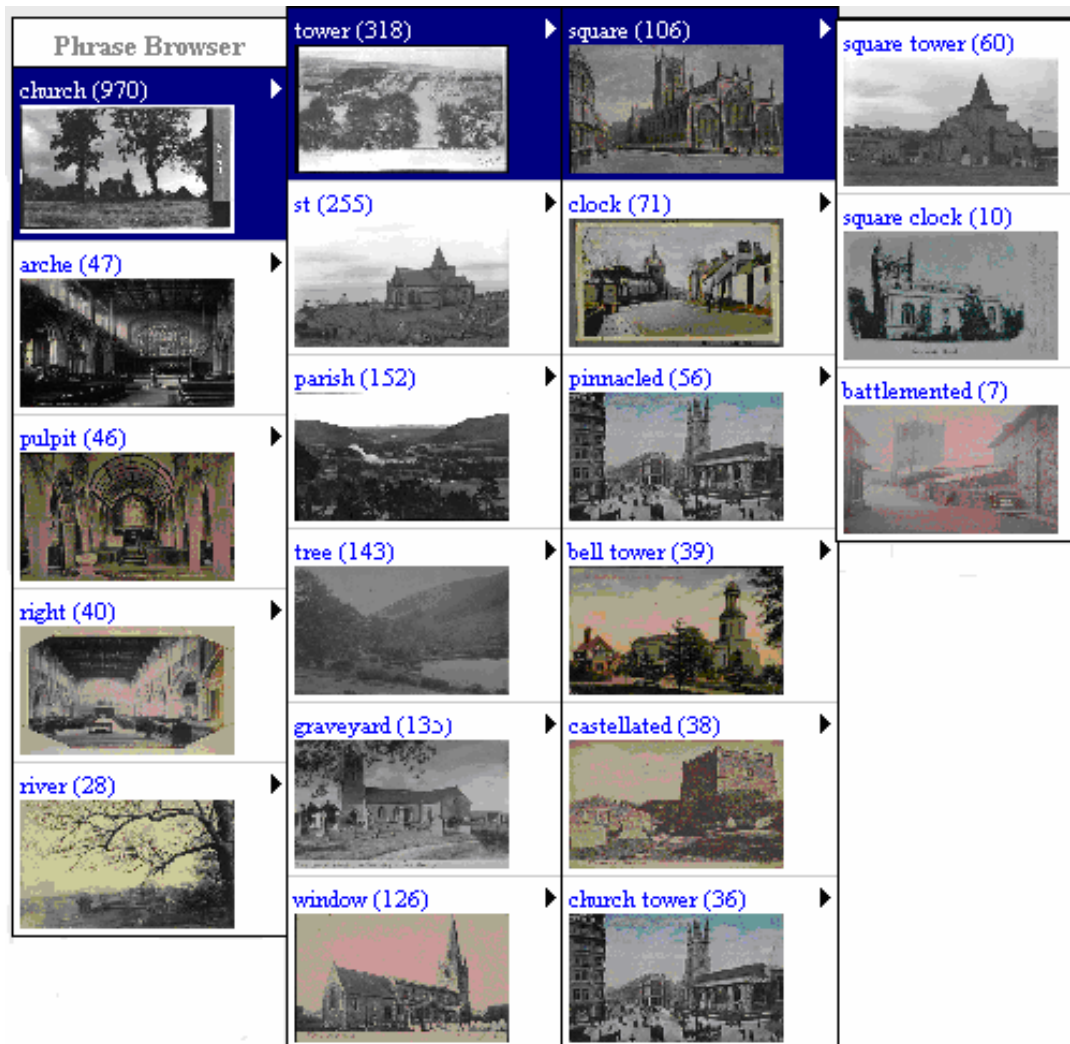
Figure 2: Example fragment from generated menu for the query “church”