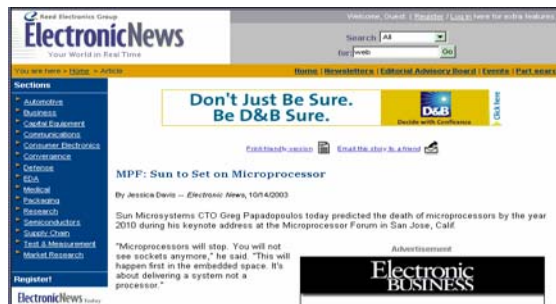
Figure 2. A template-generated document in response to a query from the Electronic News database